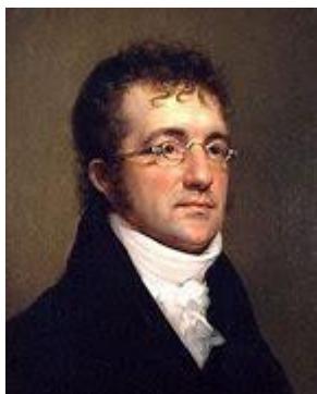
Benjamin H. La Trobe Architect/Engineer (1764-1820)

Mainly known in America for his architectural contributions to the remodelling of the White House and the Capitol buildings, as well as designing Baltimore Cathedral. Through his engineering work he brought essential clean water to Philadelphia to combat yellow fever.