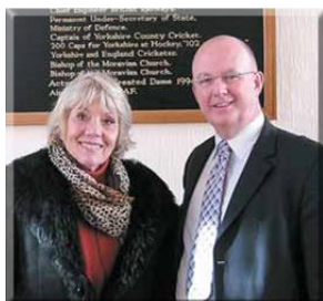
Diana Rigg DBE Actress (1938-2020)

Mainly known in America for his architectural contributions to the remodelling of the White House and the Capitol buildings, as well as designing Baltimore Cathedral. Through his engineering work he brought essential clean water to Philadelphia to combat yellow fever.