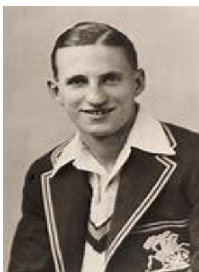
Sir Leonard Hutton Cricketer (1916-1990)

He was awarded the Nobel Prize for Chemistry in 1947 and was best known for discovering the molecular structures of morphine and penicillin.