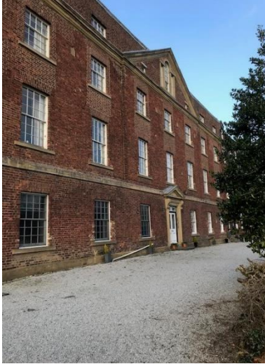
The Sister's House

Fulneck was organised similar to the way Zinzendorf had created Herrnhut. A large place for church meetings, various accommodation according to marital status (the choirs) and a place for work.