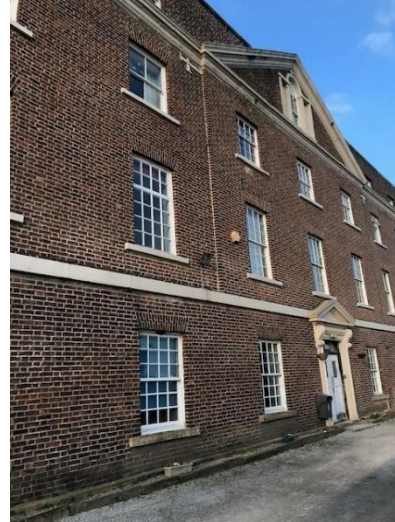
The Brethren's House